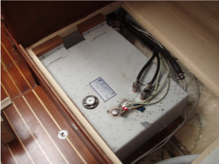
The old diesel tank before removal