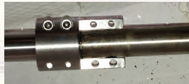
Drive shaft coupling