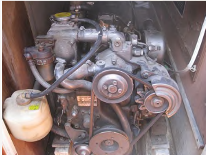
The old Yanmar