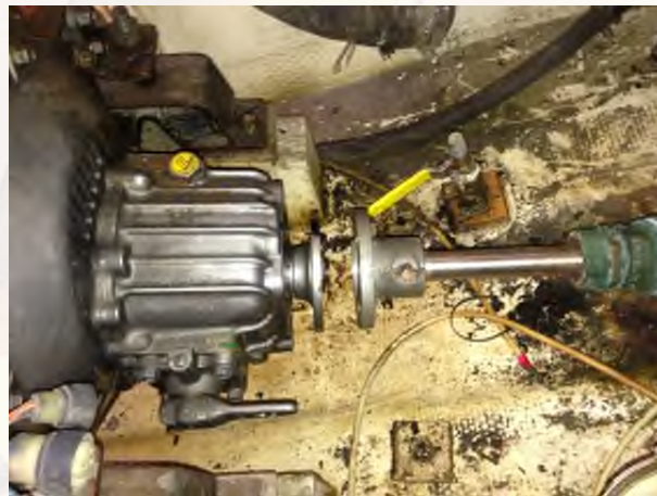
Prop shaft disconnected