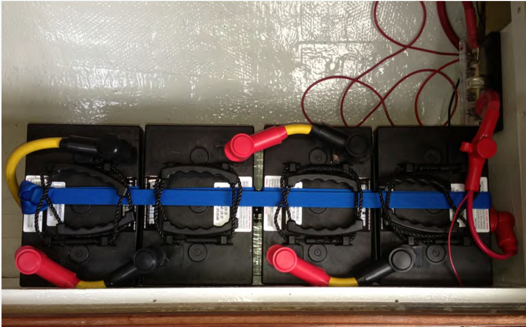
Starboard battery bank