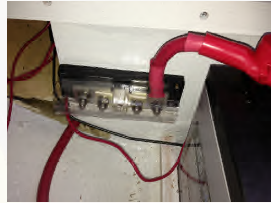
Port battery bank